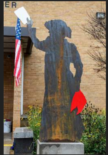
monument in Marmet, WV